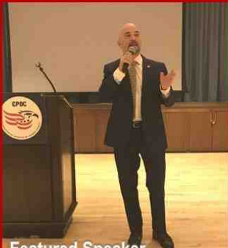
Featured Speaker JAMES P. BRADLEY Candidate - U.S. Senate