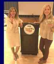
And our 50/50 opportunity drawing worth $129.