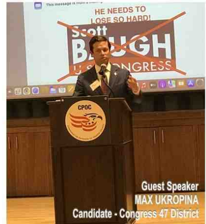
Guest Speaker MAX UKROPINA Candidate - Congress 47 District