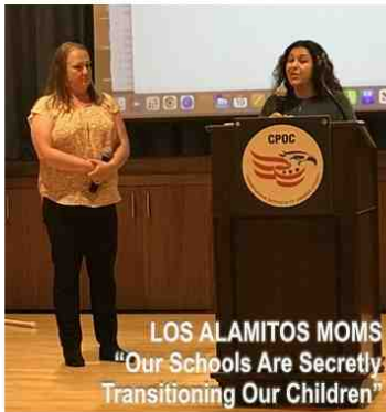
LOS ALAMITOS MOMS "Our Schools Are Secretly Transitioning Our Children"