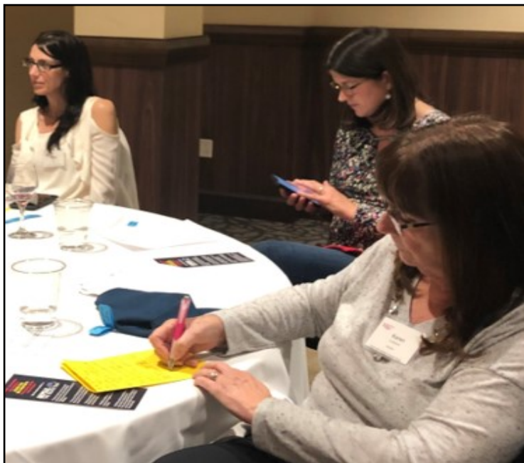
Mom's taking notes