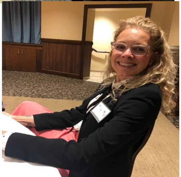
Homeschool moms enjoyed the program