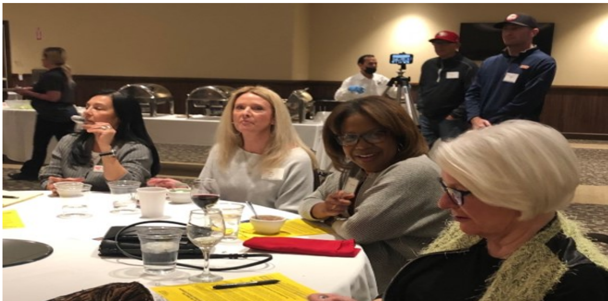
Regular members and our videographer in the background