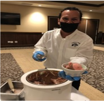
Maybe there should be ice cream at every meeting? This is spumoni to compliment the lasagna dinner.