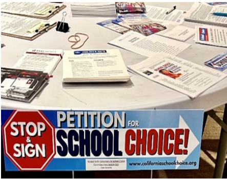
Attendees had a chance to sign the School Choice petition. A second petition that was being circulated has been withdrawn