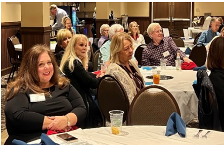
Attendees listen intently to speakers