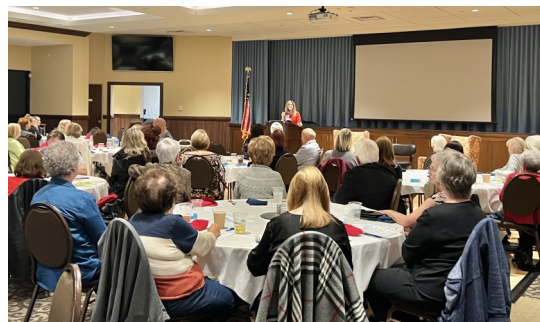
A Packed House