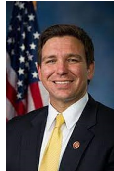
Who is Ron DeSantis? OUR NEXT PRESIDENT?

And if he were there you can bet he’d just be a troublemaker, you know, like that Trump guy!