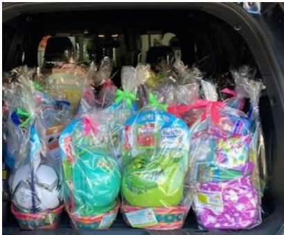
Close up of the 39 Easter baskets that were donated for the children at Camp Pendleton