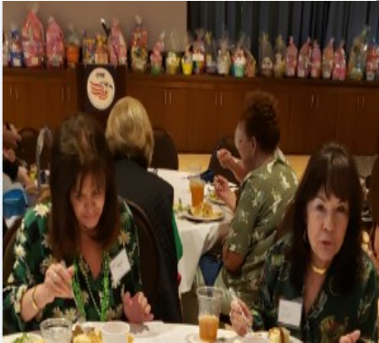
Lots of green attire and good food